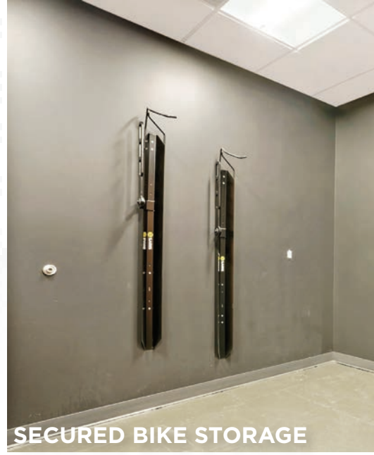
SECURED BIKE STORAGE