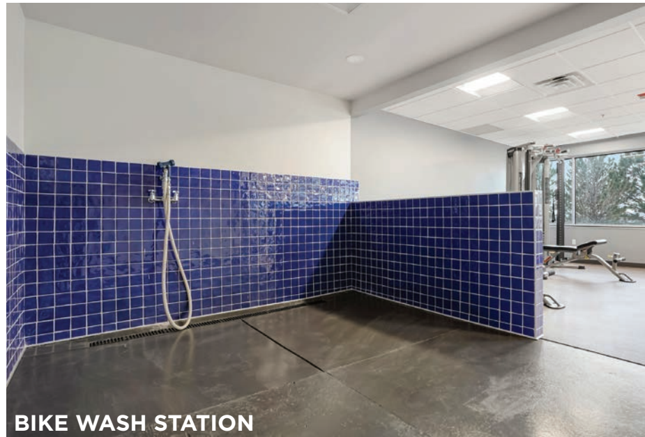
BIKE WASH STATION